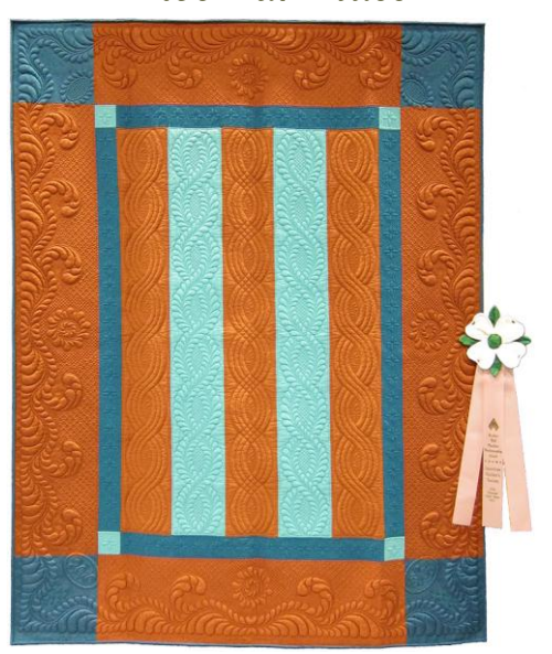
Best Wall Machine Workmanship AQS Paducah 2011